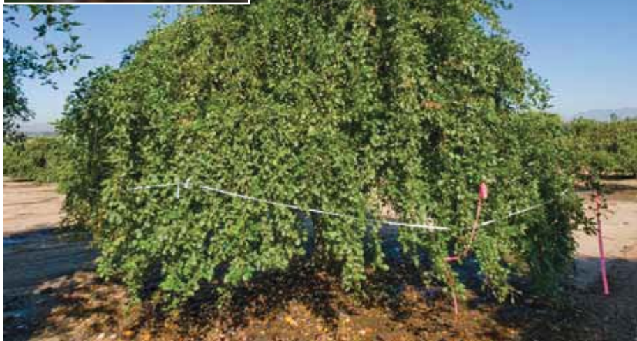
Bael fruits and foliage, Aegle marmelos , on its own roots, CRC 3140, at the Citrus Variety Collection, University of California, Riverside, 9/13/10. Tree planted in 1984. (Inset) Distinctive leaves from bael tree, Aegle marmelos , on its own roots, CRC 3140, at the Citrus Variety Collection, University of California, Riverside, 9/13/10. Tree planted in 1983.