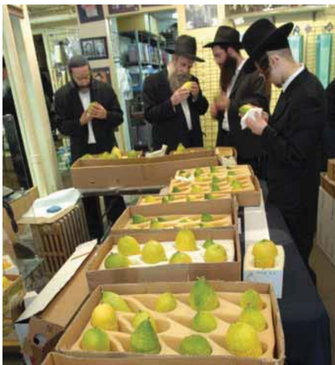
Ultra-Orthodox Jews carefully select etrogim for use in their Sukkot ceremonies at a store in Crown Heights, Brooklyn, New York, 9/9/07.

The other of the two citrus relatives on which we are focusing is bael, native to the Indian subcontinent. The hard-shelled fruits are exquisitely aromatic and are used in India for the making of juice and preserves, but its trifoliate leaves are the primary concern. Known in Hindi as " bilva ," they are used for rites of the Hindu deity Shiva, particularly in the Maha Shivaratri festival held annually in February