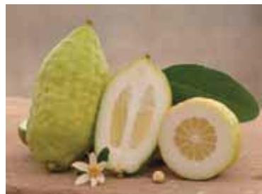
The 'Assads' variety of citron typically has no seeds when grown in isolation; it also has sweet flesh and correspondingly, white flowers, without purple. At Simon Lévy's etrog parades (farm) in the small settlement of Akridiss, Morocco, 8/26/08.

In 2008, David Karp ventured to a remote region in the Anti-Atlas Mountains of southern Morocco where the