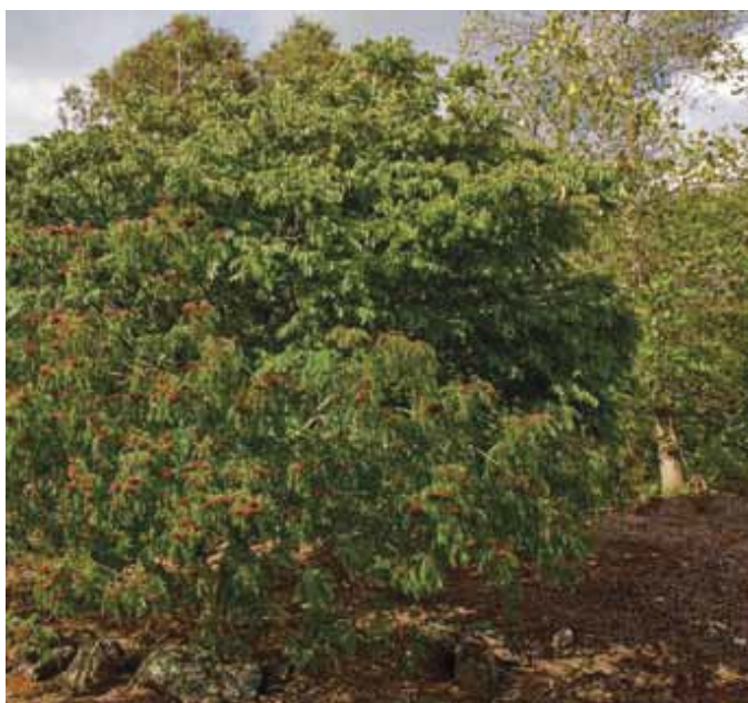
Two types of curry leaf (small leaf, with abundant fruits, in front; large leaf, supposedly from Indonesia, at rear) at Frankie's Nursery in Waimanalo, Hawaii.