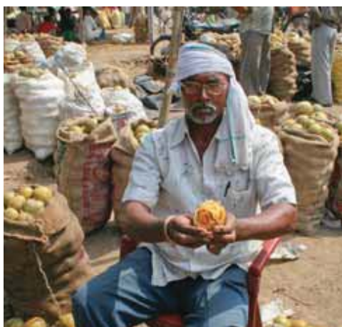
Bael fruits ( Aegle marmelos ) for sale in a market in Lucknow, 5/13/08.

We have sent curry leaf seeds to four nurseries that have submitted requests and will soon be collecting seeds from this season’s fruits. Once nurseries establish a clean source in their insect-resistant structures, they will be allowed to propagate by root cuttings, air layering, or whatever works. At least one nursery has expressed interest in propagating curry plants by tissue culture, which would require the de-