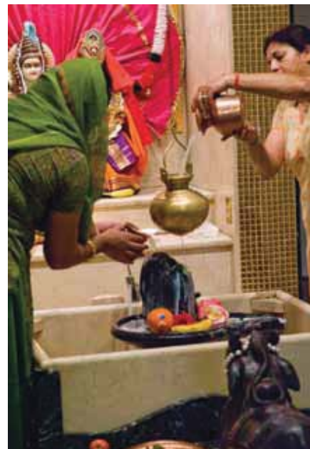
On Mondays, in the room devoted to the worship of Shiva at the Hindu Society of the Inland Empire temple, Shri Lakshmi Narayan Mandir, in Riverside, worshipers pour milk or ghee over the lingam and offerings, including bael leaves from the UCR Citrus Variety Collection, 9/13/10.