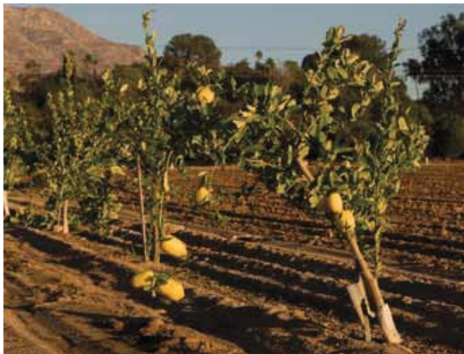
'Assads' citron, grown from seed from never-grafted stock, at the UC Riverside Citrus Variety Collection, 1/26/12.