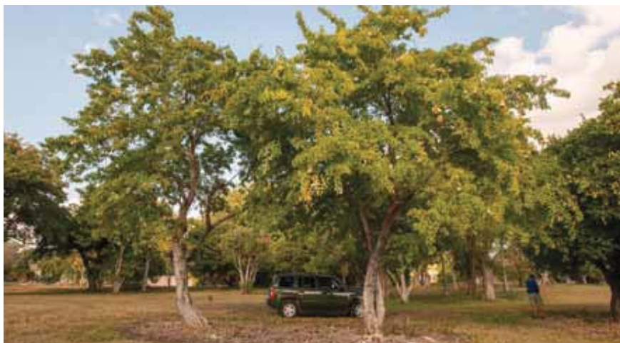
Very old bael trees at the USDA’s National Clonal Germplasm Repository in Miami, 1/18/11.