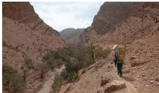
Porters carry packing materials up the valley to the 'Assads' citron plantings in Dumdir, in the Anti-Atlas Mountains of southern Morocco, 8/31/08.