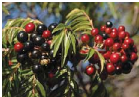
Curry leaf, Bergera koenigii, CRC 3165, at the South Coast Research and Extension Center in Irvine, CA, 12/1/08. (Right) Curry leaf trees in an insect-protected structure at the USDA-ARS National Clonal Germplasm Repository for Citrus and Dates, Riverside, 8/24/12.

The scientists at the University of California at Riverside (UCR) and the USDA who are responsible for securing California's citrus germplasm resources have long been aware of this and have made an effort to release varieties and species that were smuggled or illicitly propagated, like yuzu and sudachi, two forms of Japanese acid citrus, or kafir lime ( Citrus hystrix ), whose leaves are indispensable in Southeast Asian cooking. All were processed at the Cali-