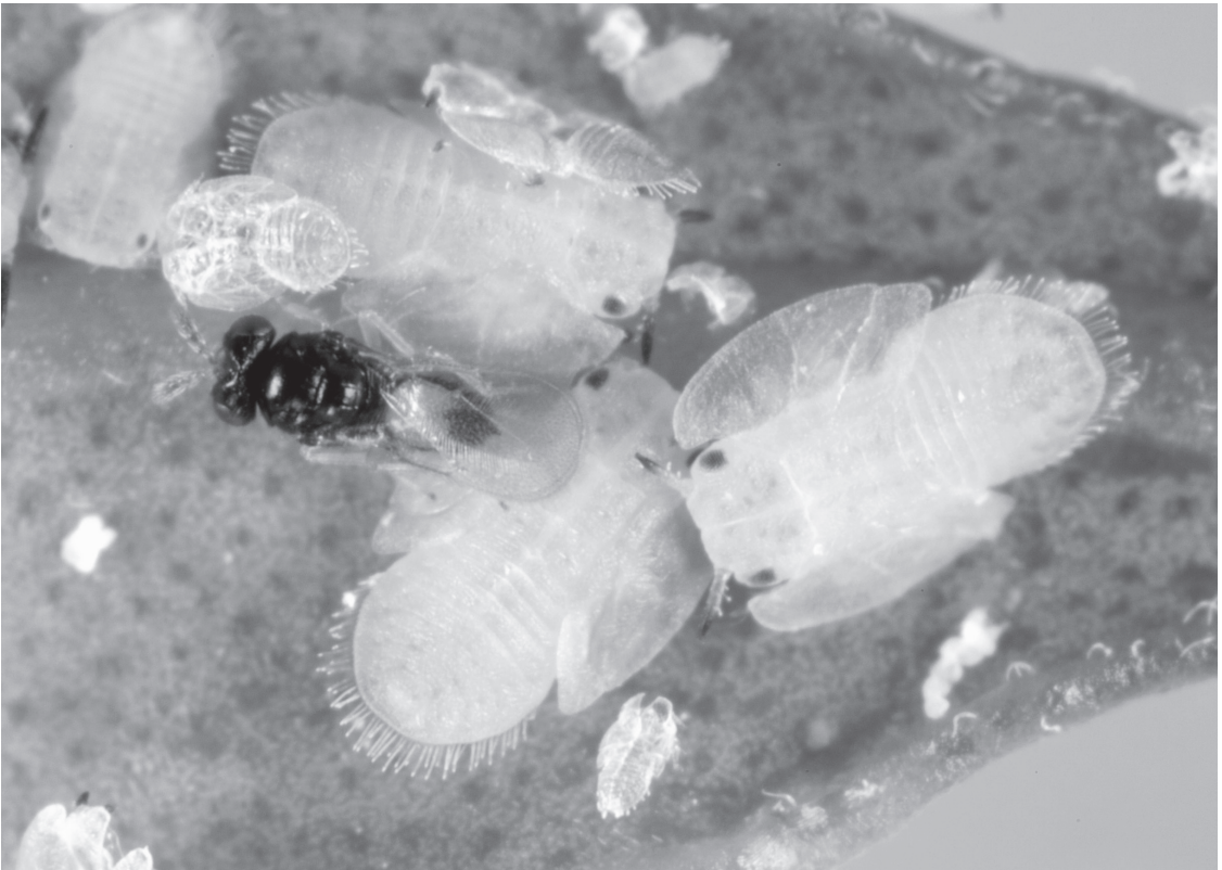
Fig. 1. Female Tamarixia radiata ovipositing into an early 5th instar Diaphorina citri nymph.

Male and female are the similar in color and body structure, except for antennae and a some-