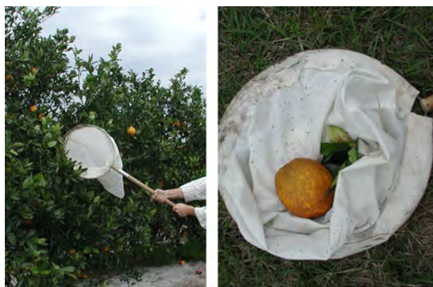
Figure 3. Use of a sweep net describing the figure 8 inside the canopy (left). Inside view of the net after the sample showing debris and ants (right).