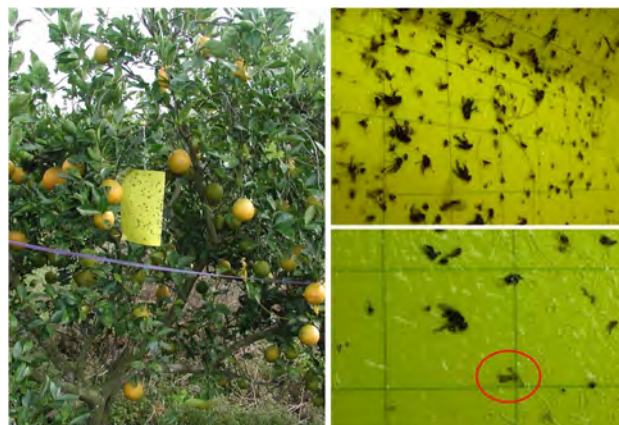
Figure 4. Deployment (left) and close-up (right) of yellow sticky traps used in citrus to monitor adult psyllid populations. A psyllid captured in the trap can be seen inside the red circle.

Therefore, sticky traps are not recommended for routine monitoring or pest management purposes.