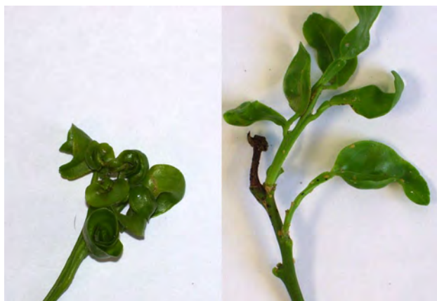
Figure 5. Damage by two sucking pests in young citrus shoots. Note the curling produced by aphid feeding (left) in contrast to twisting and deformation caused by Asian citrus psyllid (right).