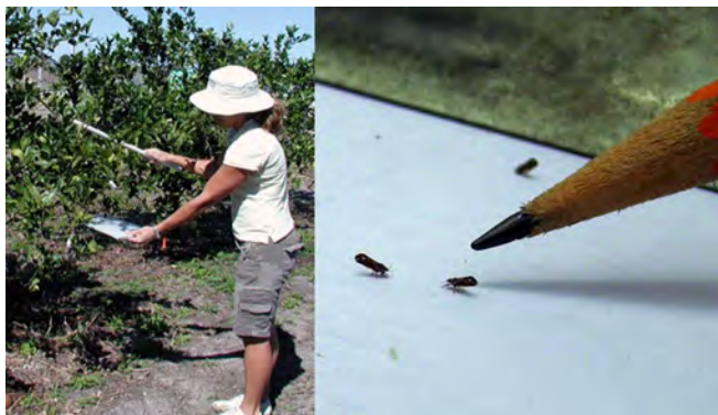
Figure 2. Stem-tap technique (left). Close up of psyllid adults on a laminated sheet or clipboard (right).