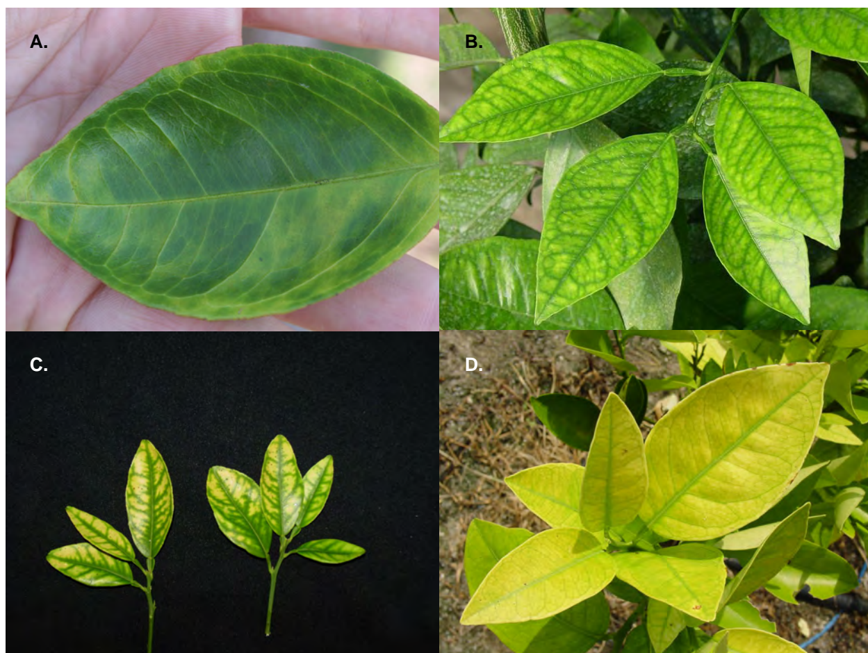
Figure 1. Citrus leaves showing HLB symptoms (A), manganese (B), zinc (C) and iron (D) deficiency symptoms.