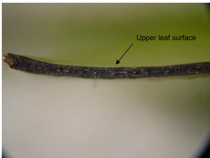
Figure 4. A leaf that showed strong blotchy mottle symptoms of HLB infection stains very dark grey to black along cut surfaces when immersed in iodine solution for 2 minutes. Note that all cell layers of the leaf are stained unlike in a healthy leaf (see Figure 3B).