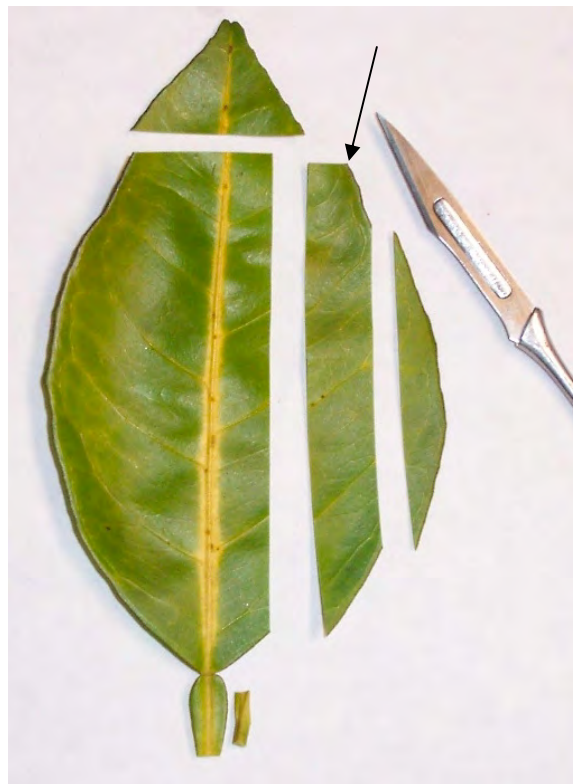
Figure 2. A citrus leaf with the vein corking symptom of HLB properly sectioned for the iodine test. The arrow indicates the symptomatic section to be used for testing.

Figures 3-5 show a series of leaf sections, including healthy leaves, HLB-positive leaves and nutrient-deficient leaves, after iodine staining. Healthy leaves may show some starch staining; however, it is generally confined to a few cell layers at the upper side of the leaf and does not show the same intensity of staining as an HLB-positive leaf (compare Figures 3B and 4). HLB-positive leaves stain a very intense dark grey to black throughout the entire cut surface (Figure 4). Nutrient-deficient leaves generally stain similar to a healthy green leaf (Figure 5).