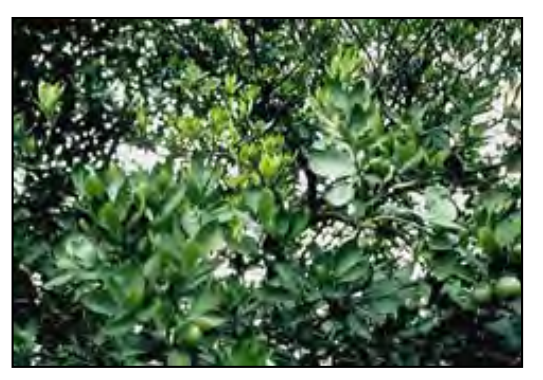
Fig. 3. Citrus greening in grapefruit, showing sectoring. Note smaller leaves on one branch of the tree.