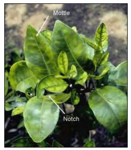
Fig. 6. Apparent zinc deficiency on new leaves, mottle on older leaves, and notched leaf from Asian citrus psyllid feeding.