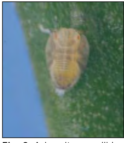
Fig. 2. Asian citrus psyllid nymph