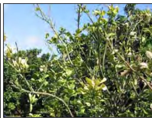
Fig. 8. Yellow shoots and defoliation caused by citrus greening infection.

HOSTS: Citrus greening infects most citrus species, hybrids, cultivars, and some citrus relatives. It severely affects most sweet oranges, mandarins, and mandarin hybrids, as well as some citrus relatives such as Atalantia , Balsamocitrus , Calodendrum , Clausena , Fortunella , Microcitrus , Murraya , Poncirus , Severinia , Swinglea , Toddalia , and Triphasia (Halbert and Manjunath 2004). There is disagreement in the literature about the status of Murraya paniculata as a host for citrus greening pathogens. It is a host in Brazil but not in Taiwan.