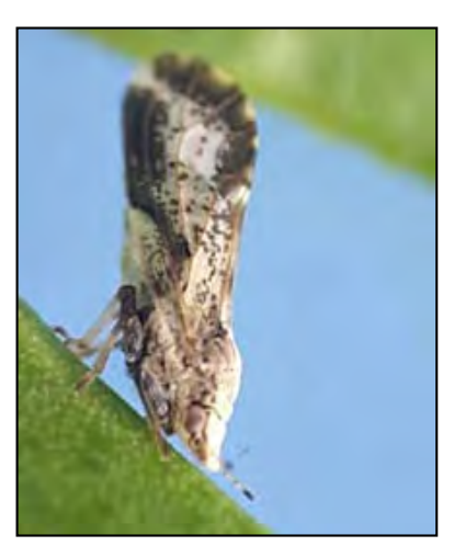
Fig. 1 . Asian citrus psyllid adult