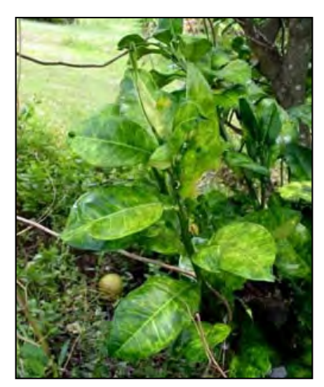
Fig. 4. Citrus greening mottle in pummelo.

PATHOGEN: Citrus greening disease is caused by phloem-limited bacteria in the genus Candidatus Liberibacter. Three species are described, including Candidatus Liberibacter asiaticus, Candidatus Liberibacter africanus, and Candidatus Liberibacter americanus (Texeira et al. 2005).