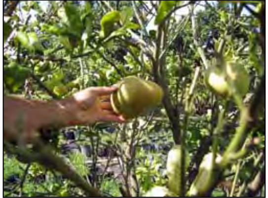
Fig.7. Lopsided pummelo.