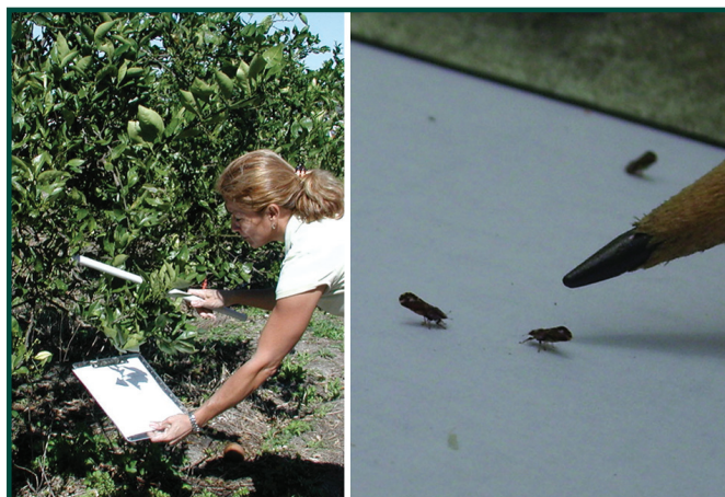
Figure 1. Taking a sample (left) and appearance of psyllids on white clipboard (right)