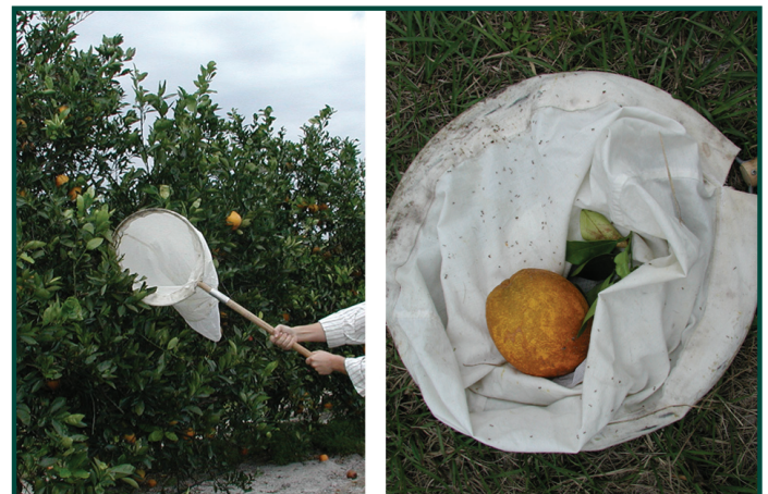
Figure 3. Use of the sweep net (left) and net with debris and ants (right)