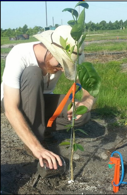
Applying beneficial fungi to a young citrus tree.

Biostimulants are available in many formulations and with varying ingredients. The most popular ingredients include beneficial bacteria, beneficial fungi, humic substances (humic and fulvic acids), and seaweed extracts. Other products may contain chitosans (a soluble version of chitin), protein hydrolysates, and inorganic compounds such as silicon. For many years, these substances were considered to be “snake oils” or substances of mysterious