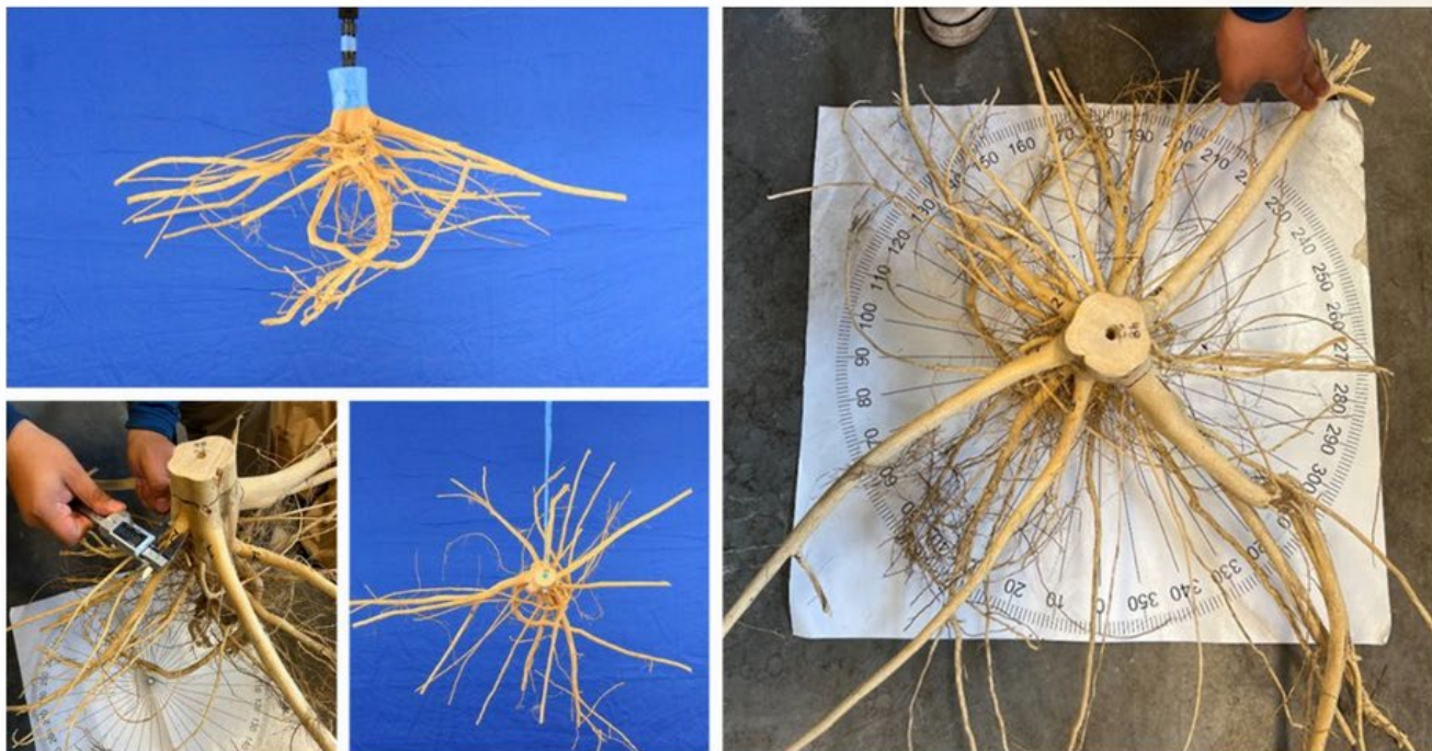
Excavated root systems were measured to assess various root traits, including depth, density and symmetry.

¼-inch or more were assessed for each tree, US-897 root systems had fewer roots emerging from the root stump compared to the other rootstocks. US-897 also had the highest proportion of roots growing vertically into the soil and the largest proportion of curved roots. There were no significant differences in these traits among the other three rootstocks.