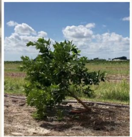
The study simulated wind-induced uprooting by pulling trees over with an electric truck winch. The maximum pulling force was measured using a digital force gauge.