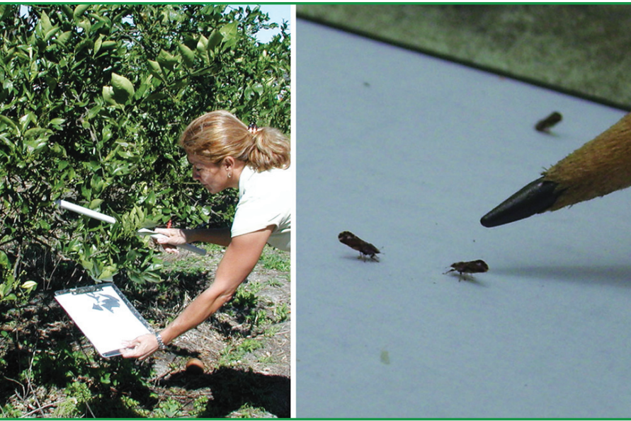
Figure 1. "Tap" sample and appearance of psyllids on laminated sheet.

A parasitic wasp, Tamarixia radiata, has been either accidently or purposely introduced wherever ACP has established and, in Florida, can cause considerable mortality, especially in late season. Together, these natural enemies often cause 90 percent or more mortality to the psyllid population. Research is being conducted in Florida, Brazil, Mexico and elsewhere to evaluate the feasibility of increasing biological control through mass rearing and release of Tamarixia radiata in residential areas and commercial citrus. While biological control has not been sufficient to avoid greening, it still contributes significantly to suppression of psyllids and other pests, and should be considered an important component of citrus integrated pest management.