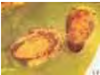
psyllid nymphs killed by parasitoids

Natural enemies of D. citri include syrphids, chrysopids, at least 12 species of coccinellids, and several species of parasitic wasps, the most important of which is Tamarixia radiata (Waterston). T. radiata was introduced in Florida (intentionally) and the Rio Grande Valley of Texas (accidentally) (Michaud, personal communication).