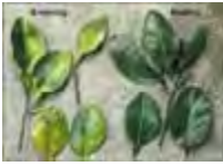
greening disease symptoms

of transovarial transmission. They summarized differences between D. citri and Trioza erytreae in various aspects of greening transmission.